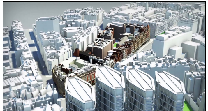
Visualisation of Knightsbridge Estate and surrounding area