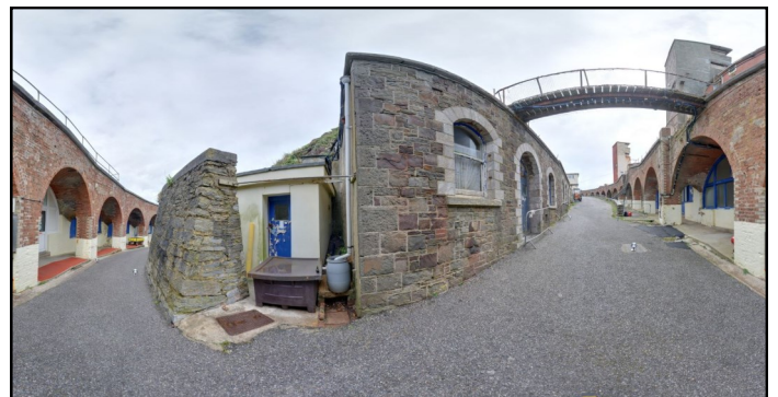
Complex building shapes efficiently captured using laser scanners